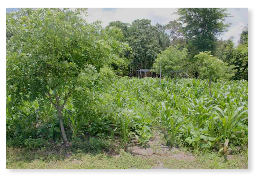
Figure 5. Cowpea ( Vigna unguiculata ) and gliricidia ( Gliricidia sepium ) as an annual and perennial legume, respectively, intercropped with maize ( Zea mays ).

In the second edition of his book Restoring the Soil, Bunch (2019) documents 117 ways in which smallholders use GMCCs. The book includes a decision-making framework for matching GMCC systems to your local context. Selecting Legumes as Green Manure/Cover Crops (ECHO Staff, 2017) and ECHO's interactive GMCC Selection Tool may also be helpful for selecting context-appropriate GMCCs. Farmers are most likely to grow GMCCs that provide benefits in addition to soil improvement, such as edible beans, fodder, and/ or weed suppression.