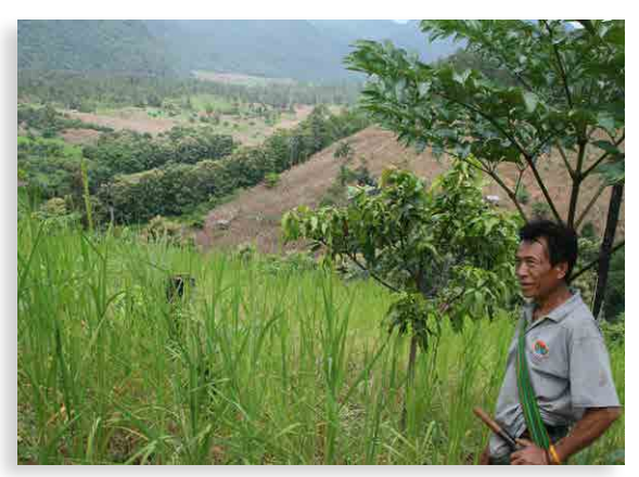
Figure 1. An example from Thailand of smallscale agricultural landscapes affected by interacting influences of climate and farmer management.

Farmer involvement, buy-in, and ownership are foundational to agricultural improvements in general. Initiatives to improve agricultural lands will not succeed unless farmers accept the practices being