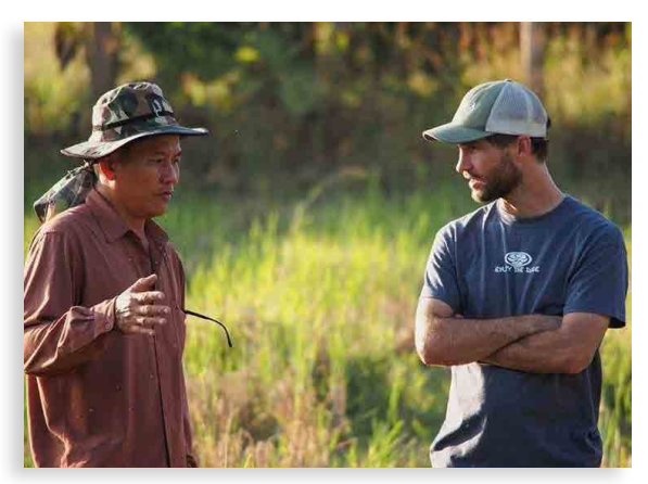
Figure 4. Gathering farmer knowledge, as illustrated here, is essential to involving farmers in climate change mitigation.

How can smallholder farmers help mitigate against climate change? Key to any agricultural approach for dealing with climate change is dialogue with farmers (Figure 4), whose knowledge, experience, and participation are critical for success. In our conversations, we should distinguish between adaptation and mitigation. Adaptation strategies increase farmers' resilience and reduce their vulnerability to loss. Mitigation strategies directly reduce the causes of climate change. Some farming practices are helpful both for adaptation and for mitigation. For example, reduced tillage makes a field less vulnerable to erosion (adaptation) while also allowing for more carbon to be stored in the soil (mitigation). Below are a few strategies that