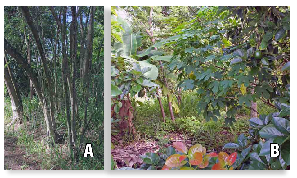
Figure 7. Woodlot (A) and food forest (B) demonstrations at ECHO's Global Farm in Florida.

this means the regrowth that occurs after coppicing will store significant amounts of carbon. Small woodlots have proven successful in Haiti, where the Mennonite Central Committee promoted them through an effort called "ti fore" (Creole for "little forest" or microforest).