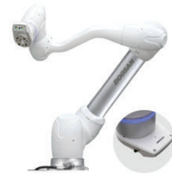
Smart Vision Module (SVM)

Various apparatuses such as pallet and laser scanner can be installed, and various storage spaces allow convenient storage and usage.