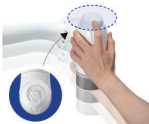
Direct Control Unit

Customers can maximize the performance and production efficiency of their Doosan robots by adding various functions.